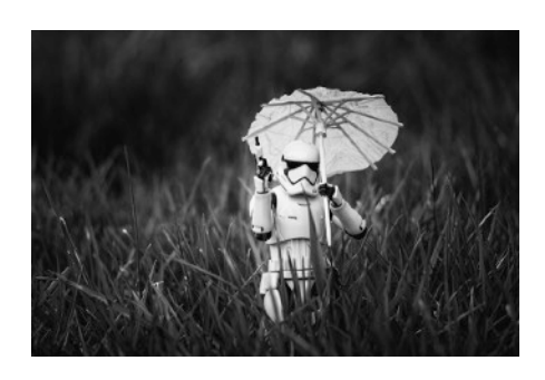
B/W 1st Kelly Bunch